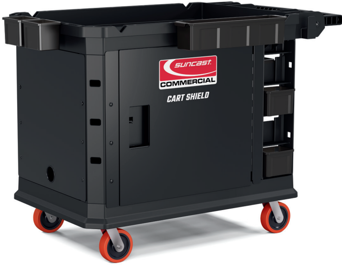
PUCCS2645 Cart Shield model shown on the PUCHD2645 Utility Cart (not included)